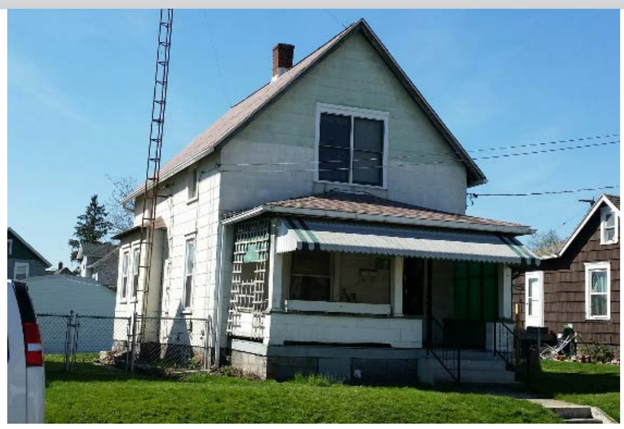
Information is believed to be accurate but not guaranteed. KIKO Auctioneers

Directions: From W. Tusc and Harrison go south to right on 11th St. Watch for KIKO signs.